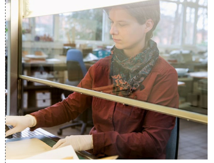
Paper conservation in the lab