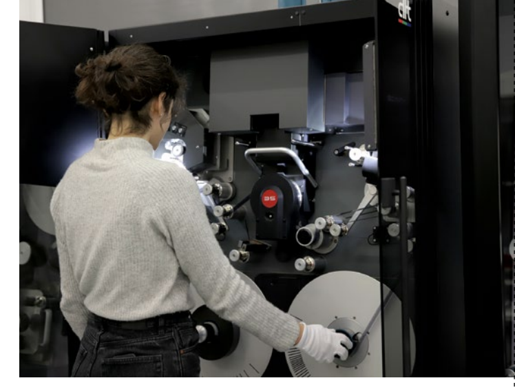
High-performance system for film digitization